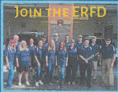
"Join Our Team" AUGUST 10, 2023

Reach - 1.8K Reactions - 28 Comments - 0 Shares - 6