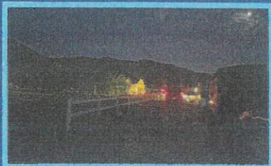
"Loss Tonight" SEPTEMBER 22, 2023

Reach - 1.4K Reactions - 81 Comments - 3 Shares - 0