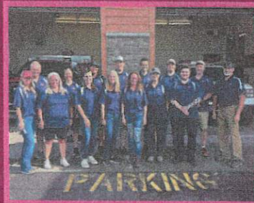
"First Responders Day" OCTOBER 28, 2023

Reach - 102 Reactions - 17 Comments - 0 Shares - 2