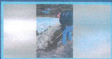
"Clean Storm Drains" MARCH 13, 2023

Reach - 1.3K Reactions - 32 Comments - 3 Shares - 4