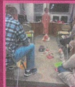
"EMTs Practice Airways" OCTOBER 27, 2023

Reach - 77 Reactions - 14 Comments - 0 Shares - 1