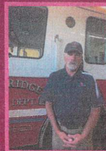
"September 11" SEPTEMBER 11, 2023

Reach - 12 Reactions - 29 Comments - 0 Shares - 1